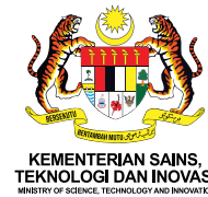
Ministry of Science, Technology and Innovation – Malaysian Science and Technology Information Center (MASTIC)