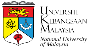
Universiti Kebangsaan Malaysia

MOSP appreciates the data contributors who has helped in making research data sharing a reality. Through this showcase of commitment by the agencies and universities, MOSP is proud to present research data from 7 repositories cutting across 10 research fields.